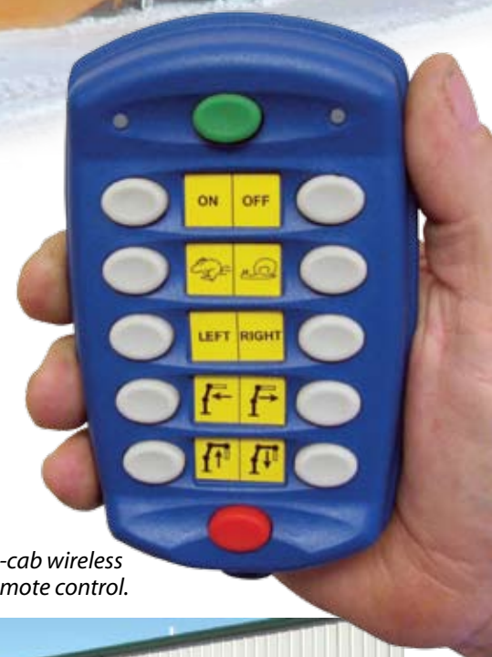
In-cab wireless remote control.

Running the Snowblast is easy. All its functions are operated from a wireless remote control panel inside the cab or from the snowblower mounted control panel.