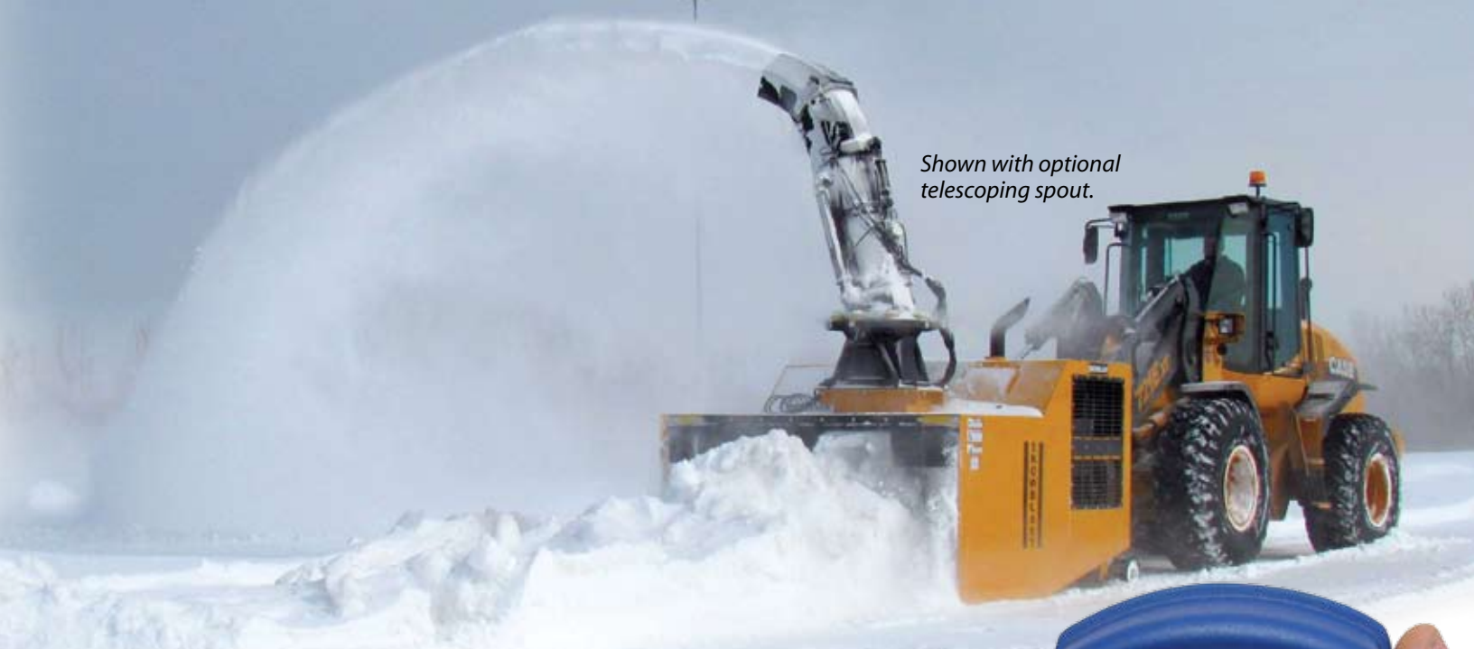
Shown with optional telescoping spout.

Safety is an important element with a Snowblast snowblower. The snowblower's engine is mounted directly behind the blower unit. This gives the machine's operator a full range of sight for oncoming traffic and potential hazards in the area.