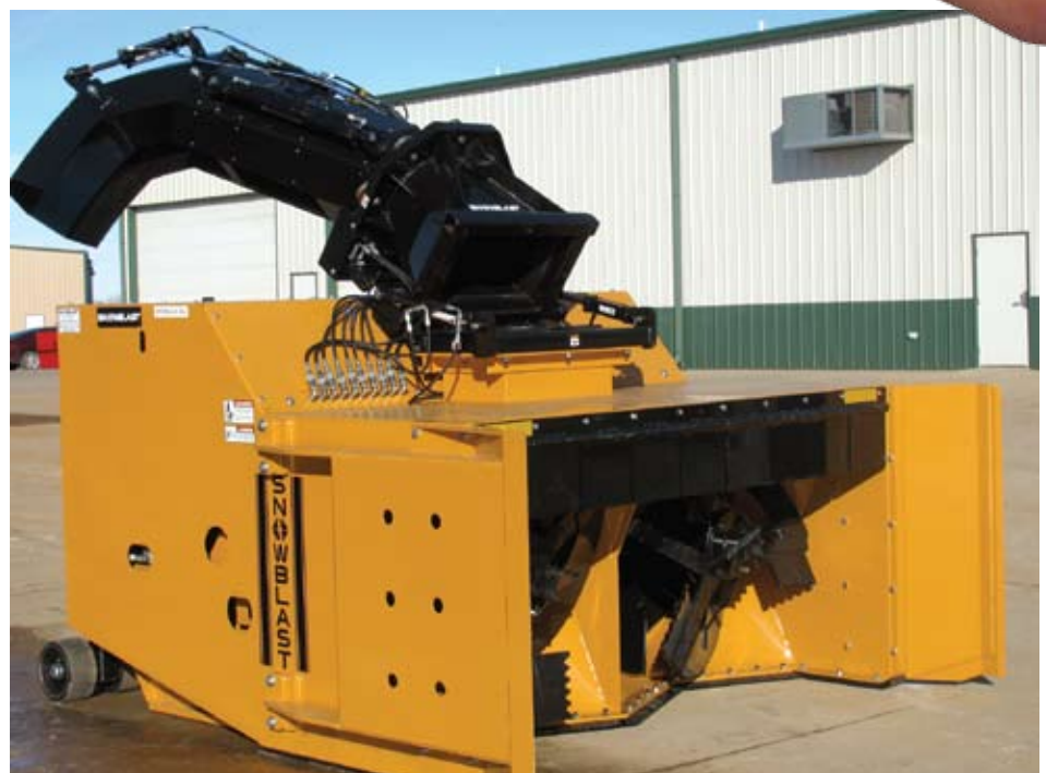
Shown with optional Folding Spout, Caster Wheels and Side Extensions