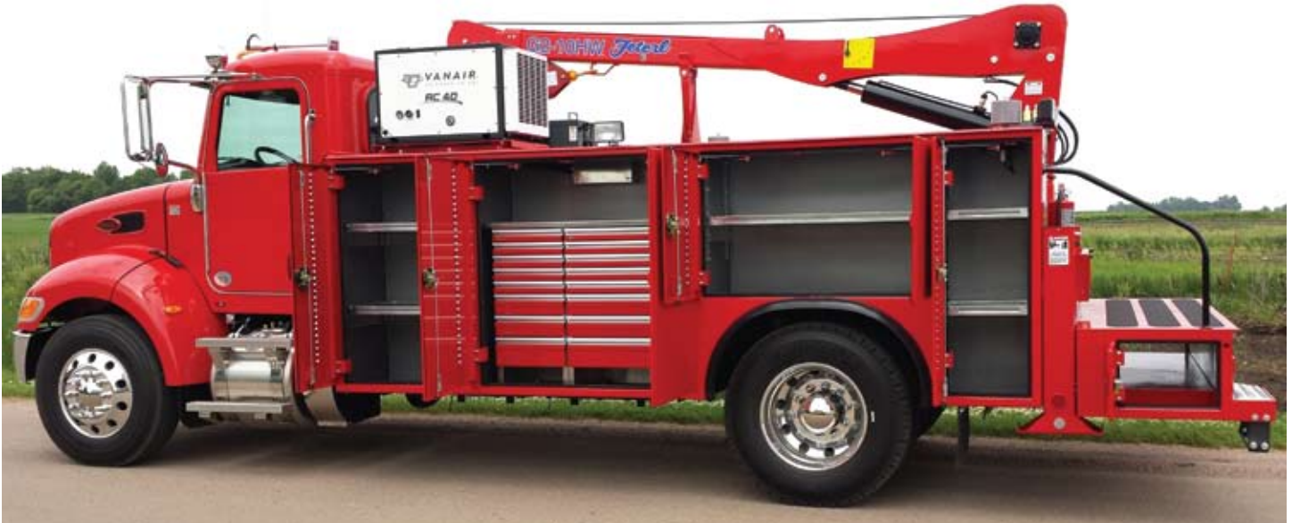
Equipped with Hydraulic Powered Air Compressor and Wireless Proportional Controlled Crane