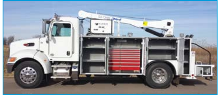
33,000 GVW - 120" CA. (Model 10,000)