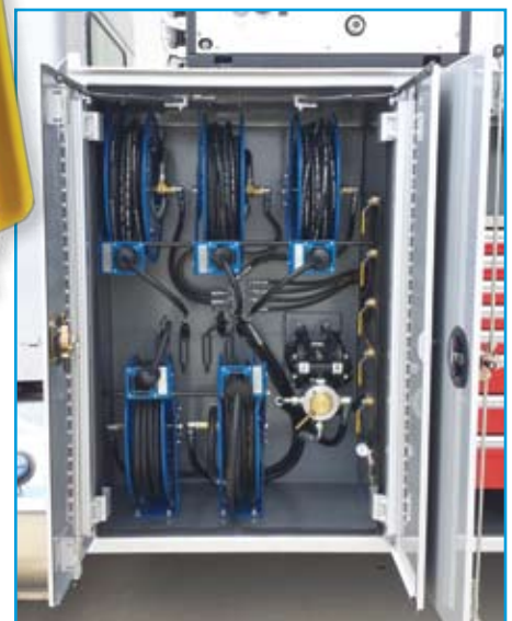
Lube and EVAC Systems Available