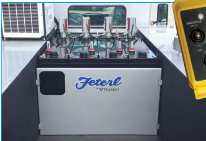
Lube and EVAC Tanks (Stationary or Skid Mount)