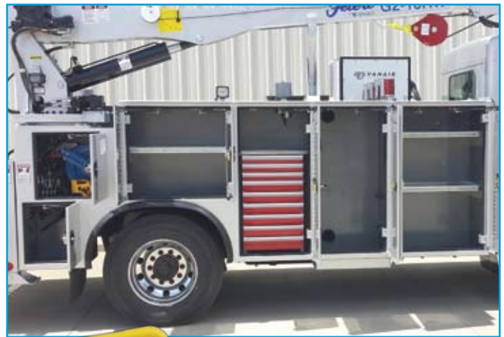
Optional Tool Boxes Available