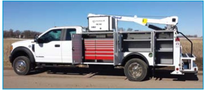
19,500 GVW - 84" CA. (Model 6000)