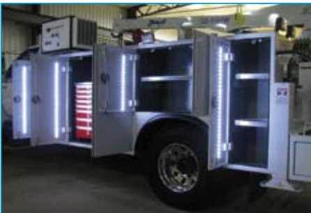
LED Cabinet Lighting with Soft-stop Gas Shock Door Holders