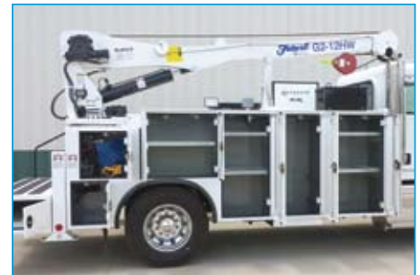
Single Panel Doors with Stainless Steel Internal Hinges