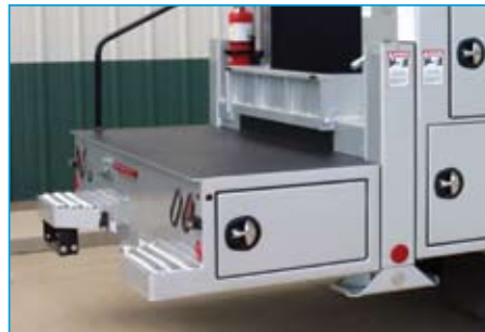
Large 30" Work Deck with Full Width Compartment, Receiver Hitch and Trailer Lights