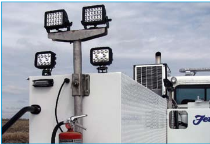
Optional Pole Lights

NOTE: TEAMCO INC. Reserves the right to change the above specifications at its own discretion.