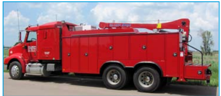
Custom Designed Bodies for Tandem Chassis