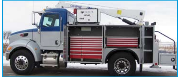
26,000 GVW - 84" CA. (Model 8000)